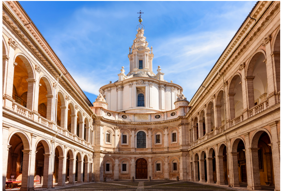
IACS 6 will be held at Sapienza University of Rome in 2026 (Pictured: Sant'Ivo alla Sapienza)